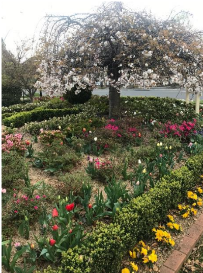
Spring Garden at St Thomas Aquinas Church