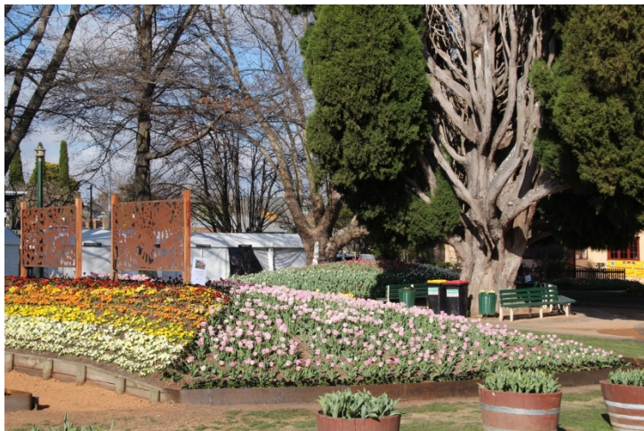
Tulips at their best, again.