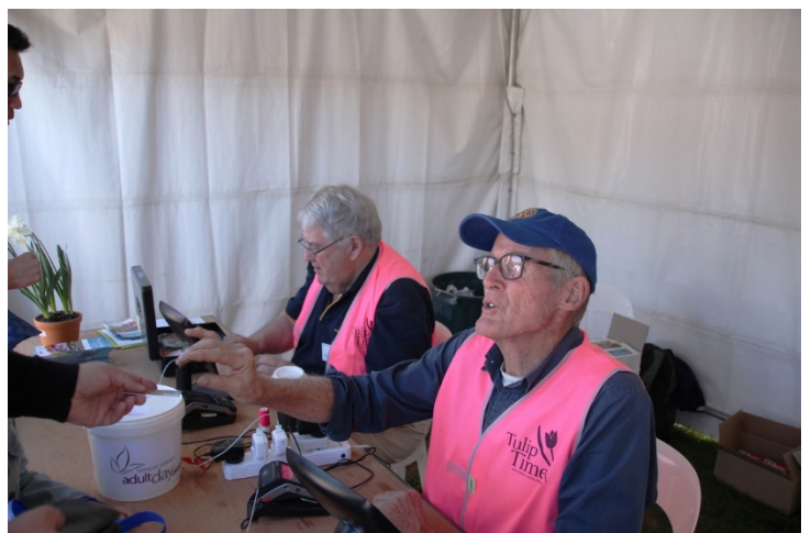
Two wise monkeys!