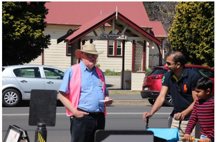
Just 5 more days to go?