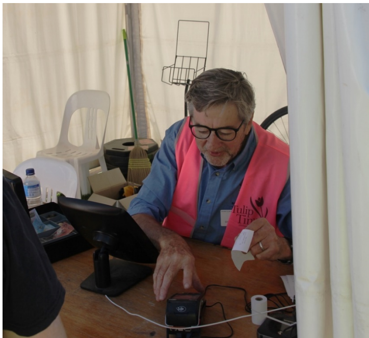
"I told you I was not good with technology!"