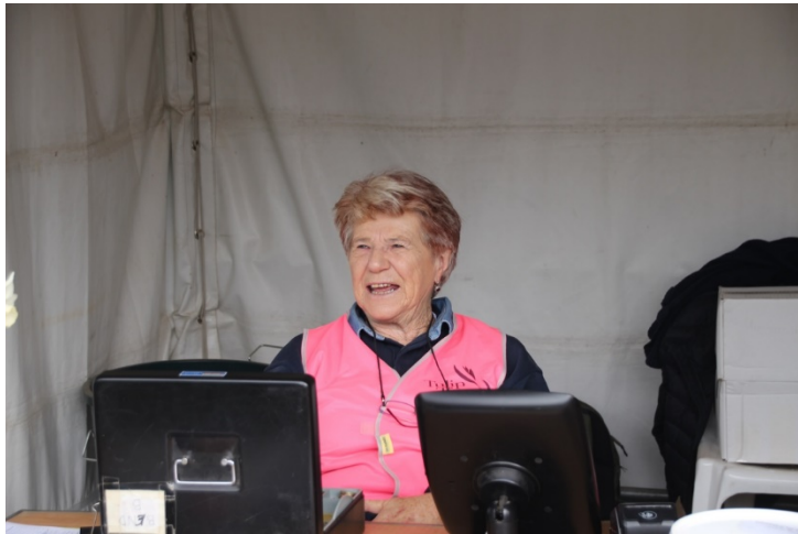
The Gardens are alive to the sound of music!