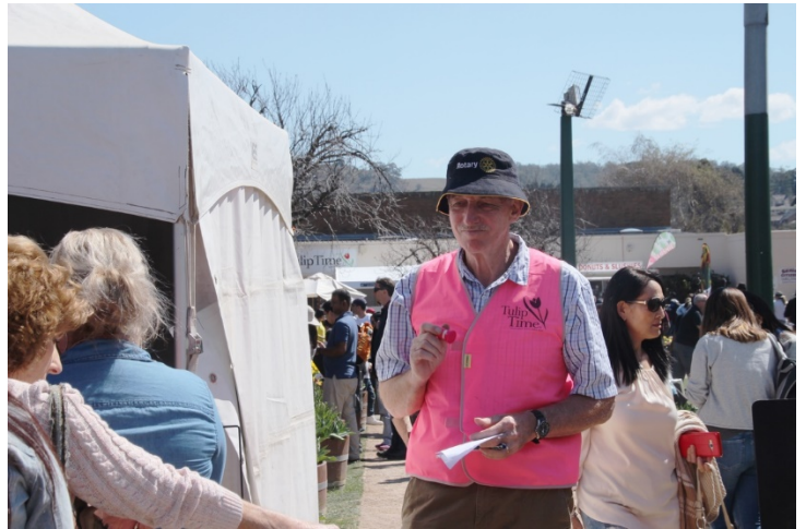
Which joke have they not heard?