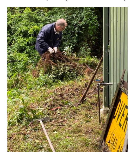
Will in overload as per the sign