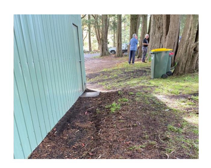
Great clean up job gentlemen!