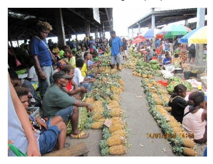
Market in Honiara

Malaria work continues and the Rotary Club of Honiara has been in the RAMS project distributing netting and insecticide and taking part in the education program to reduce the incidence of malaria among the people.