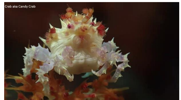
Crab aka Candy Crab