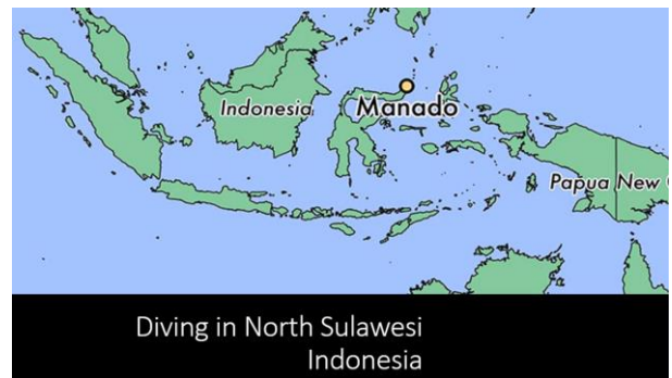
Diving in North Sulawesi Indonesia