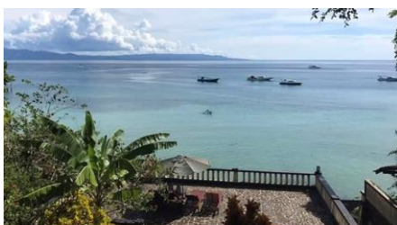
Diving in North Sulawesi - Indonesia

Below is a collage of some of the little creatures many of us would not see as they are only several mm long.