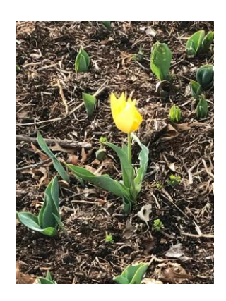
The season's first tulip!