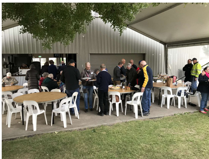
The masses trying to get warm.