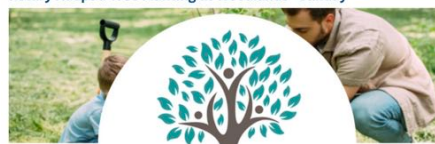
Rotary Adopt a Tree Planting at Woodlands - Sunday