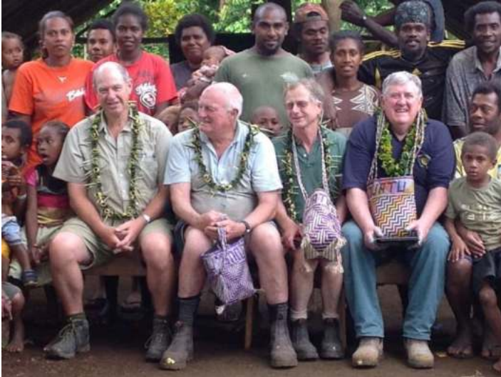
INTERNATION SERVICE TEAM in VANAUTU