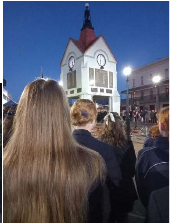
Bowral High School Interact Club, School Captains and prefects Dawn Service Anzac Day Mittagong.