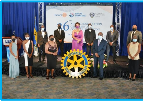
Board of RC of Barbados South

Last weekend the Club ran IndeHUNT - a scavenger hunt to celebrate independence with a range of community activities and a huge raffle as a major fund raising project.