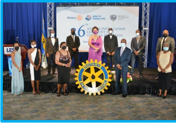
Board of RC of Barbados South

Last weekend the Club ran IndeHUNT - a scavenger hunt to celebrate independence with a range of community activities and a huge raffle as a major fund raising project.