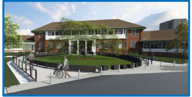
Artist Impression of the new Outpatients Centre

Currently the main challenge facing the hospital is getting staff. The hospital performs about 50 operations a week, deals with 70 patients in the Emergency Department each day and has 2 to 5 births each day.