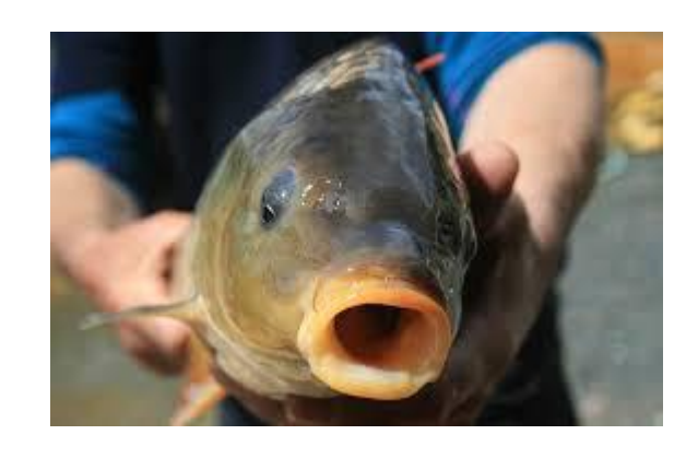
Carpathon - Wingecarribee River Burradoo 5<sup>th</sup> March