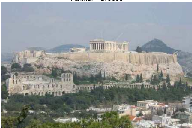
Athinai - Greece