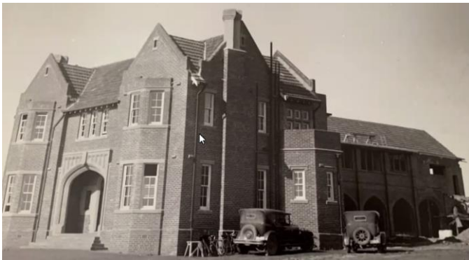
Canberra Church of England Grammar School - 1929