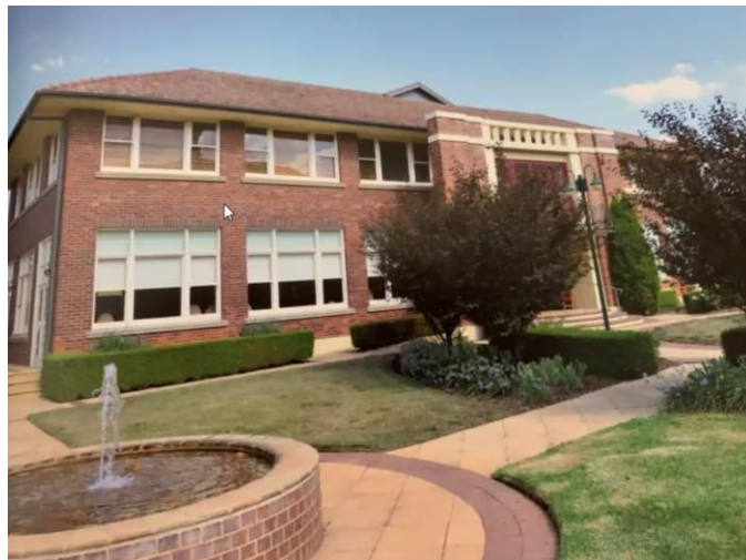
Westwood Building – Annesley Girls School – 1956