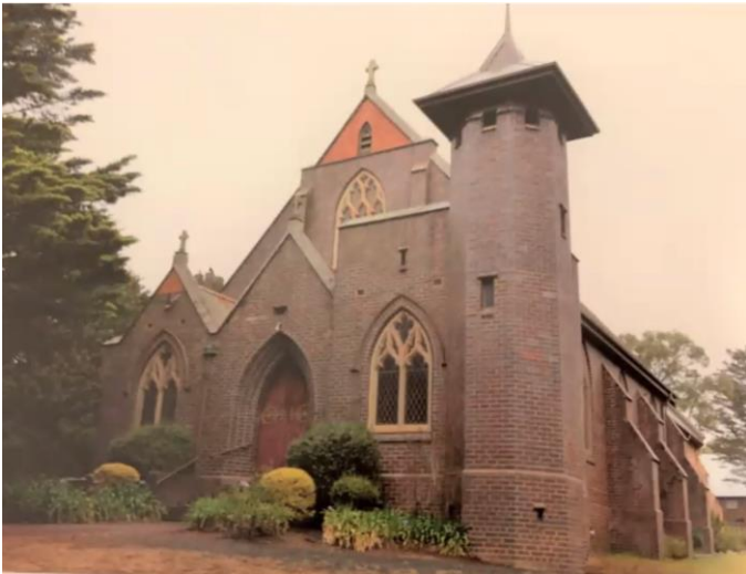
St John's Church of England, Moss Vale