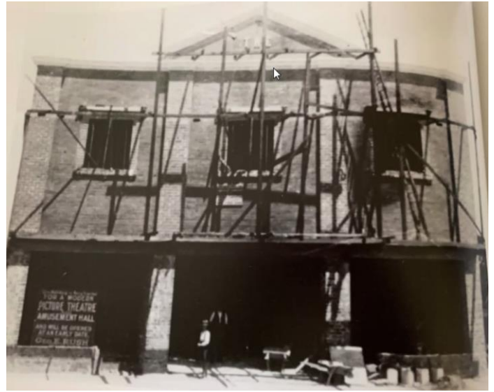
Empire Cinema Theatre – roof raising – 1927