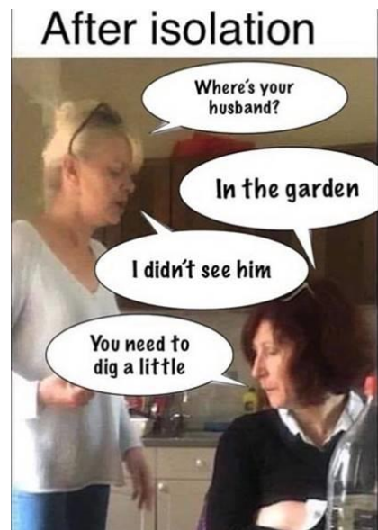
The Fun Section