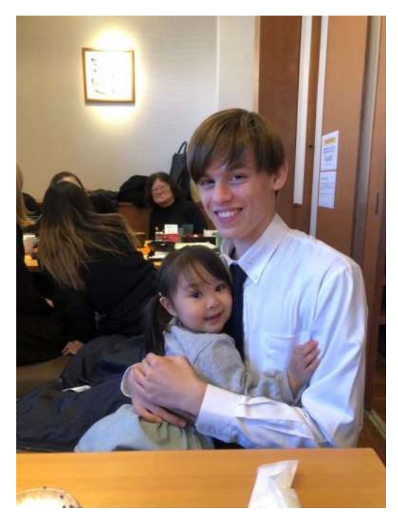
Figure 1 Ashers new friend