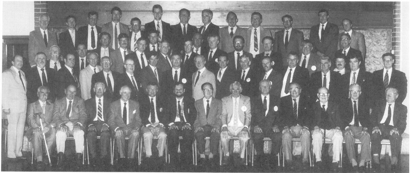
Membership of Bowral-Mittagong Rotary Club