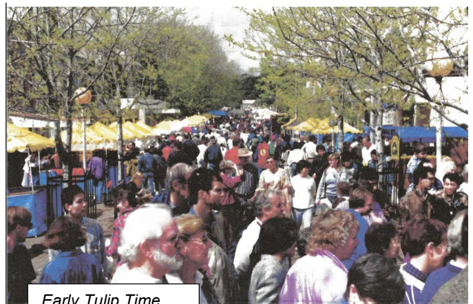
Early Tulip Time