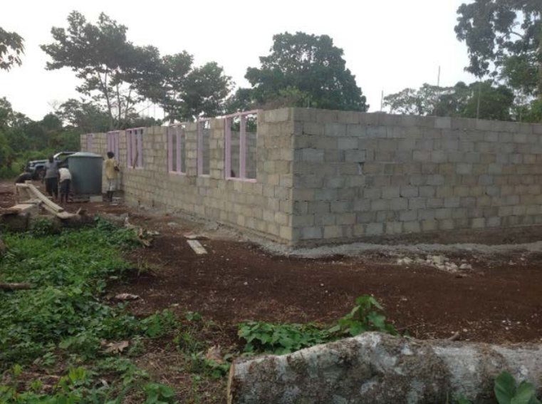
Walls nearing completion – beautiful mortar work Jacinta!

Robert de Jongh - Tulip Time roster - seeking clarification on availability to allow roster to commence to be prepared.