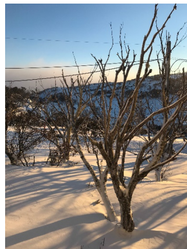
Another day in paradise