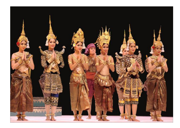
Traditional Cambodian dancers

Its 15½ million people are mainly the descendants of the Khmer people. After the dreadful genocide following the Vietnam War and the war with Vietnam which drove the Khmer Rouge out, a coup brought the current Prime Minister Hun Sen to power in 1997. Today the country's main foreign exchange earners are fabric manufacture and tourism.