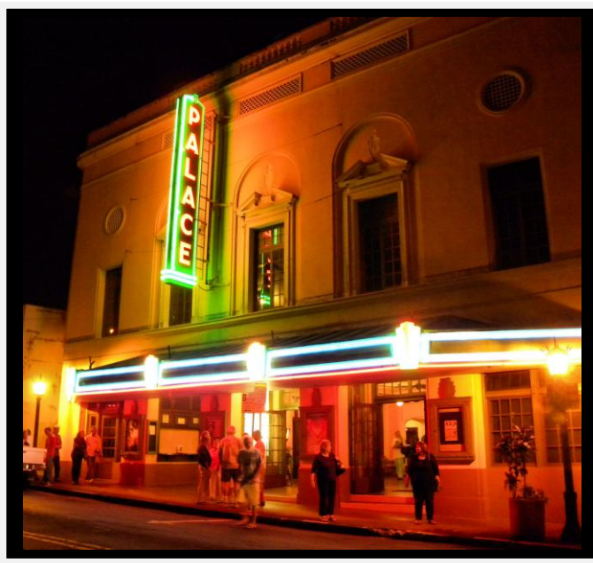
We attended The Tempest at the historic Palace Theater in Hilo. This film adaptation of Shakespeare's great work was filmed in Puna and showcases our dramatic terrain and weather.

Rotary Club of Pahoa Sunset Mission Statement: "In the spirit of Rotary's 4-Way Test, our mission is to serve the local and global community and our club members by implementing dynamic programs that address current and emerging needs. Our goal is to achieve meaningful results in an atmosphere of fun, fellowship, and aloha."