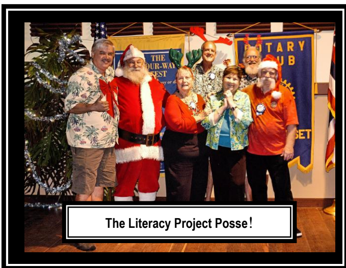
The Literacy Project Posse!