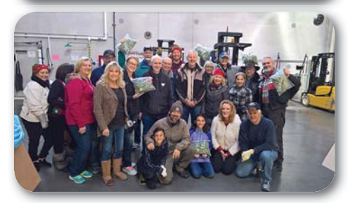
Over 4,500 pounds of frozen green beans were packaged!