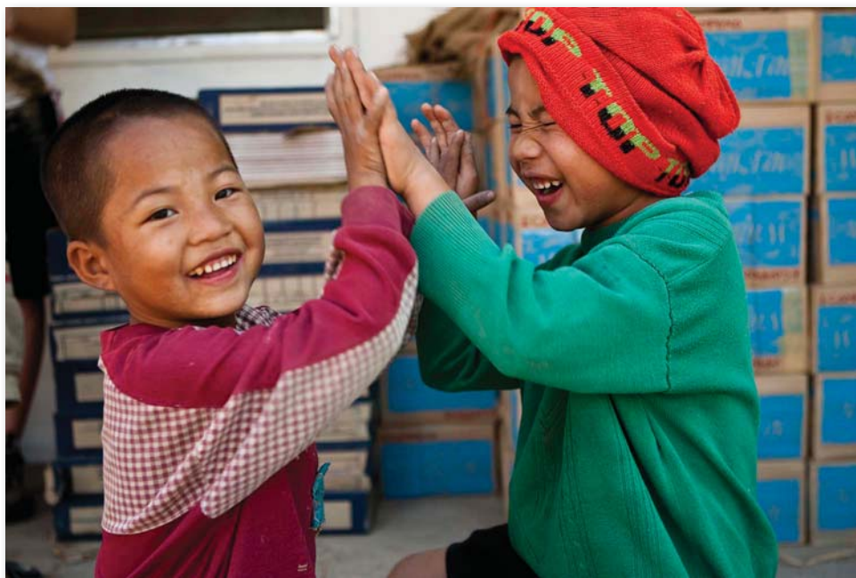
Akha hill tribe children at the Akha Training Centre in Mae Suai, Thailand. The Akha Training Centre takes in children from 27 Akha villages. Some are orphans, and others are sent by their parents, who want them to receive an education. The facility teaches English and Thai, which helps the children function in mainstream Thai society. Rotarians from Australia, Canada, Thailand and the United States have volunteered and provided donations.