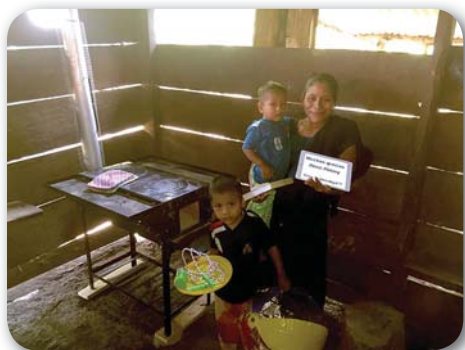
A woman and her children in Guatemala with their new wood burning stove that vents the smoke outside their home.