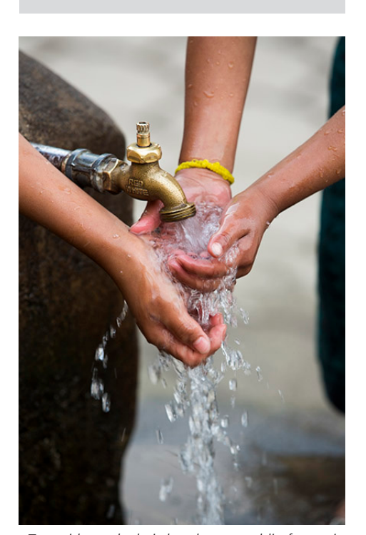
Two girls wash their hands at a public faucet in Santa Maria, Guatemala.