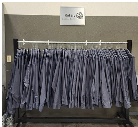
The Reno Rotary Foundation awarded a Vocational Service grant to Truckee Meadows Community College for their Diesel Mechanic program to provide uniforms. The students are pictured, along with a rack of uniforms.