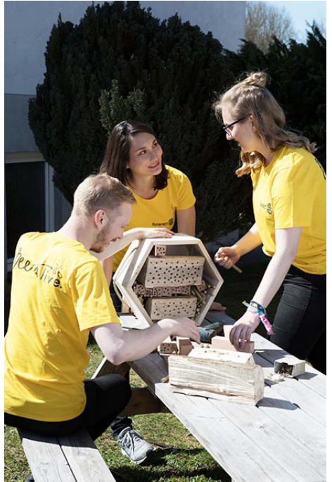
Members of German Rotaract clubs build and install bee hotels near Augsburg, Germany. These structures combat habitat loss and support bees as pollinators.