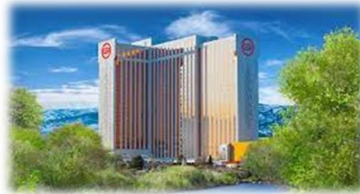
A fabulous venue - The Grand Sierra Resort in Reno NV