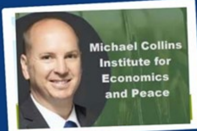
Michael Collins Institute for Economics and Peace