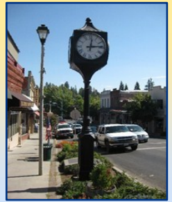
Club 529 chartered March 16, 1925