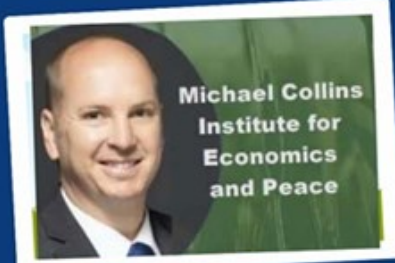
Michael Collins Institute for Economics and Peace