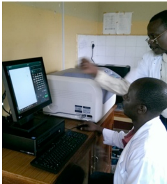
Staff using the digital system

The Rotary Club of Tahoe Incline is pleased to announce the completion of its Global Grant to install a digital x-ray system at Kagondo St. Joseph Hospital in northwest Tanzania. The $42,000 project was co-sponsored by the Rotary Clubs of Solvang, CA, Santa Ynez, CA and Anthem, AZ, and several individual members of our Rotary club.