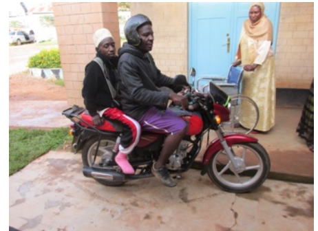
Deadly motorcycle taxi

better roads are built with increasing traffic, the incidence of motor vehicle accidents (MVA) is rising rapidly. Motorcycles acting as taxi's are a major cause of accident