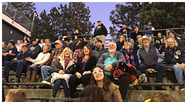
Nevada Union and End Polio Now fans

Welcome to Foundation Night Nevada Union High School style! Nevada Union Football has a long standing tradition of taking time to recognize one of the many dedicated non-profits in Nevada County. This year they chose to recognize Rotary International and the Rotary Clubs of Area 4 and District 5190. Rotarians in our community go to great lengths to support Polio eradication efforts through Rotary International. All Rotarians in attendance were asked to stand for a moment to be recognized for this life-saving work.