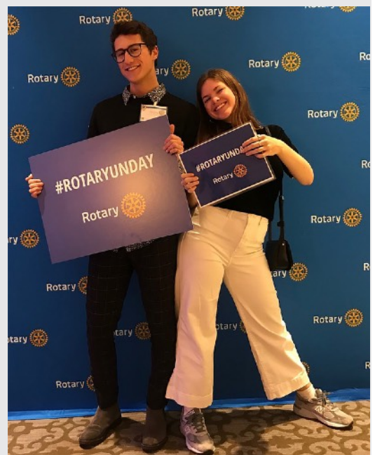
RYE Rebounds gain renewed passion for Rotary at the Rotary Day at the United

As for the Rotary Day at the UN, what an unforgettable experience!!! I was able to go with another rebound from Romania here at Columbia and we had a blast. All the speakers were truly inspiring and they definitely made an impact on my aspirations and thoughts going forward. I can't wait to share some of the things I learned and heard when I come back home in the winter. I met so many Rotarians from all over and truly made some connections I never would've dreamt of had it not been for Rotary! My friend and I are looking into chartering a Rotaract chapter here at Columbia, and I am also looking into joining the Rotaract Club of the United Nations! Wish me luck! I've also included some pictures for you below from the event for you.