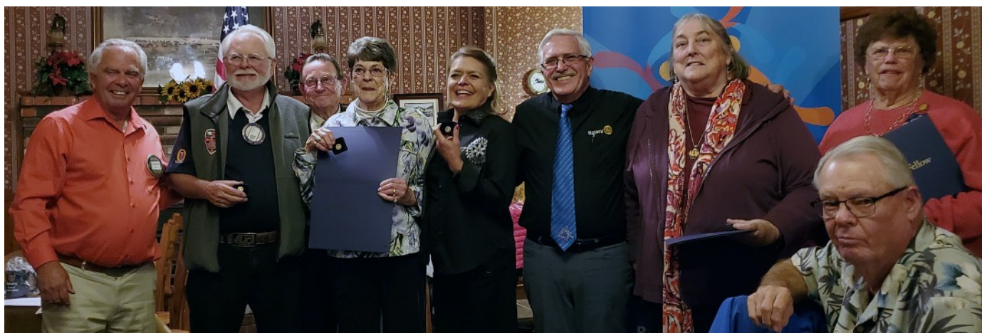
Rotary Club of Smith Valley Paul Harris recipients