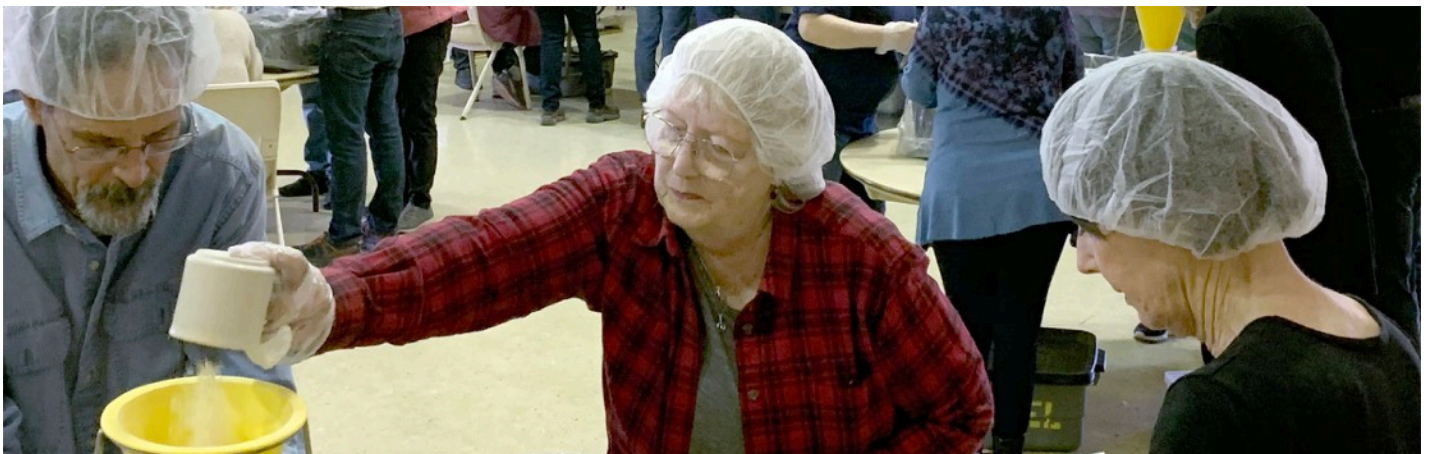
Hunger doesn't have to exist - let's end it together

On Saturday, January 11, the Rotary Club of Bishop and Rotary of Club of Bishop Sunrise joined together to host the Rise Against Hunger food-packaging event at the Methodist Church in Bishop. The event was promoted in The Inyo Register inviting the general public to help. A number of non-Rotarians participated to bag 10,000 meals in just a couple hours.