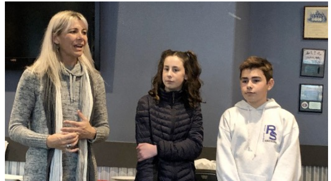
Breaking Down the Walls strives to unify, empower and engage students to create a positive and supportive campus.