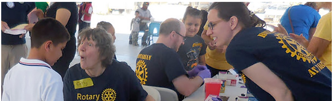
Rotarians sooth fears during blood testing at the Los Barrels project