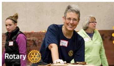
TOP 5 STORIES OF 2014 Read about the most popular "Rotary Voices" posts for the outgoing year