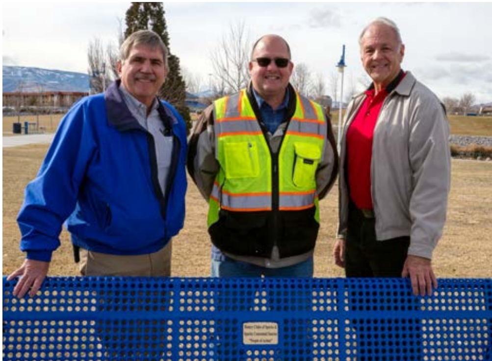
Sparks Marina Park Benches Rotary Club of Sparks and Sparks Centennial Sunrise – People of Action District Service Grant 2017-18

With the new year, we have updated Grants Policies, timelines, spending plans and other details for 2019-20. One very exciting change is Bonus District Designated Funds. Clubs will receive Bonus District Grant funds based on their Annual Fund giving three years ago. All of our District Service Grant Funds come from our Annual Fund giving three years ago; this new program will allow our Clubs to see a direct connection to and tangible benefit from their Annual Fund Giving. Check our District Website in early January for all the documents.