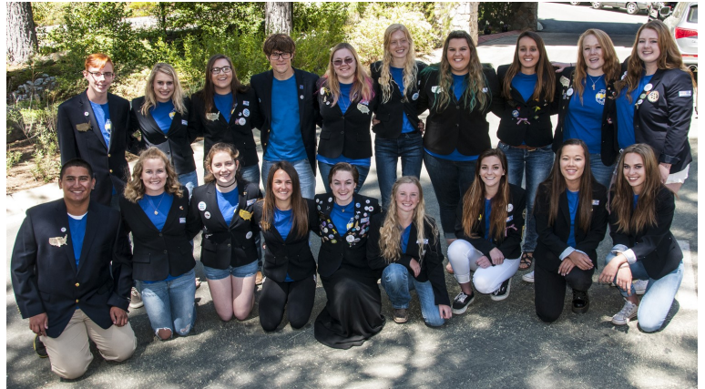
Photo of outbound students