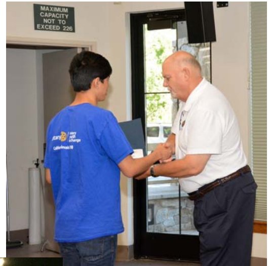
Above: DG Doug presented each of the outbound RYE students a Certificate of Completion of the orientation class