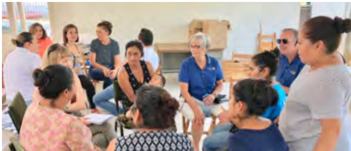
Focus Group as part of Community needs Assessment for the Chiapas project. Bishop Sunrise Global Grant.

Spending Plans now Due. The District applies for the District Block Grant using YOUR Club's spending plans. We cannot apply without your specific plans. Download the fillable form from the District website. District Website under For Members, The Rotary Foundation, Grants. https://www.district5190.org/sitepage/grants