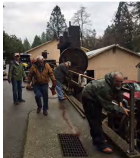
Construction repairs at North Star Museum

We welcome our fellow Rotarians and guests to visit Penn Valley Rotary!