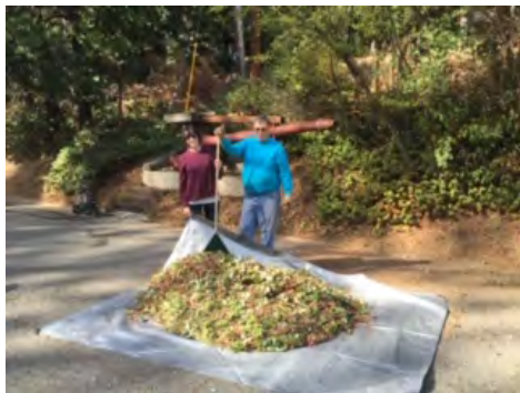
Clean-up NorthStar Mining Museum

This has been a very busy year at the 49er Rotary Club. Our in town projects consisted of multiple Senior Wood deliveries, finishing the interior stairs at the North Star House, participating in the Area 4 Heritage Garden project, as well as the work we will be doing out at Pioneer Park for Rotarians at Work day. A new event for us this year is an appreciation dinner for our Duck Race sponsors. This is an appreciation dinner as well as an event to invite non-Rotarians into a club event setting. Our largest projects this year were actually years in the making. We were able to have a group of Rotarians travel down to Mexico to work on the Smiles Without Borders project and we are continuing our work on the Filadelfia Medical Clinic which is also in Mexico. Smaller but just as important projects, are our annual Thesaurus giveaway, multiple RYLA and REGL students, Interact at Nevada Union high school and Seven Hills Middle School, and helping ACME Robotics with funds to get to the international Robotics competition.