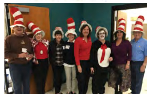
Spanish Springs Elementary School – Rotary Club of Sparks Centennial Sunrise DSG 2018-19