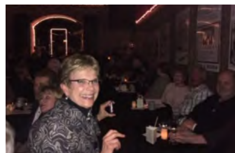
Area 4 Social night