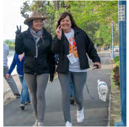
Thank You D5190 Major Donors!