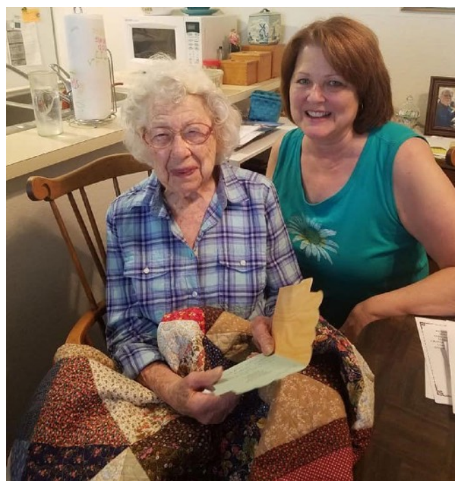
Volunteer delivers meals on wheels in Nevada County as part of the Gold Country Community Services grant

Another example of People of Service teamwork involved the Rotary Club of Grass Valley South and the Rotary Club of Penn Valley. Gold Country Community Services' Meal on Wheels program found a sudden increase in the need for meals for seniors and shut-ins, during the COVID-19 pandemic. In order to increase food purchases for these needs, Grass Valley South reached out to the Penn Valley Club for additional funding. With their support, the Grass Valley South club submitted a grant for matching funds and donated $4,000 to the Meals on Wheels program to cover the increase in requests so that no one would go hungry.