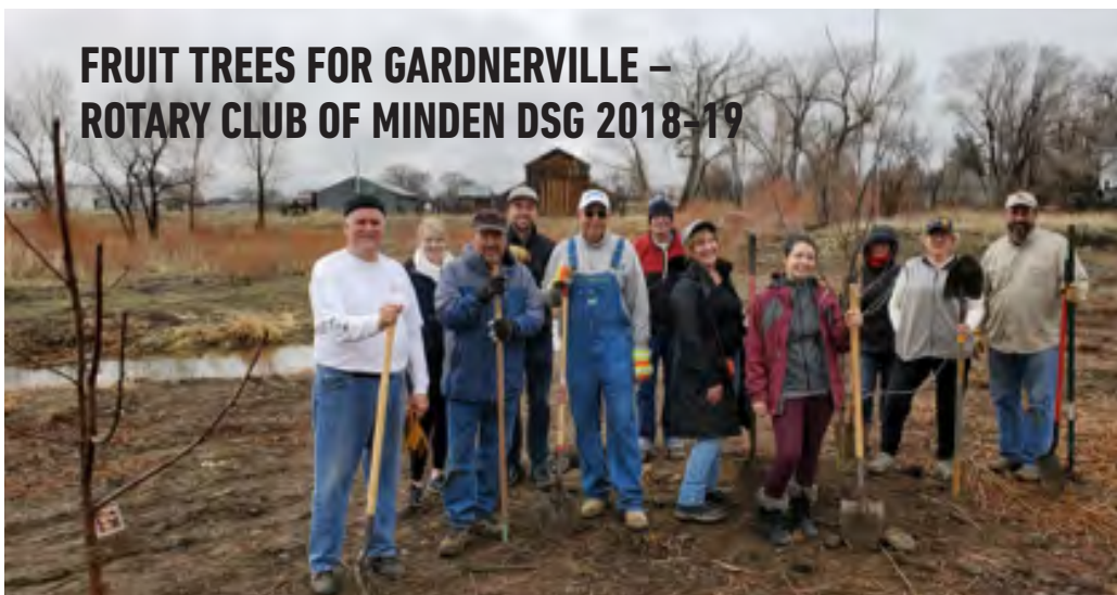
FRUIT TREES FOR GARDNERVILLE – ROTARY CLUB OF MINDEN DSG 2018-19

Doing Good in our Communities and Across the Globe begins with Club Grant Qualification and Execution of the Club MOU and D5190 Addendum