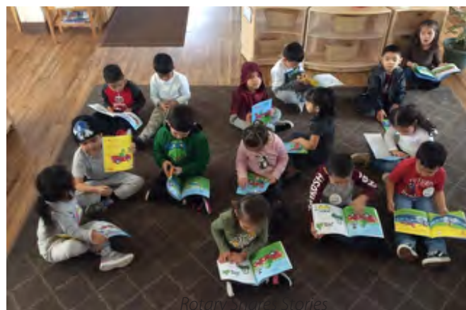
Rotary Club of Truckee DSG 2018-19