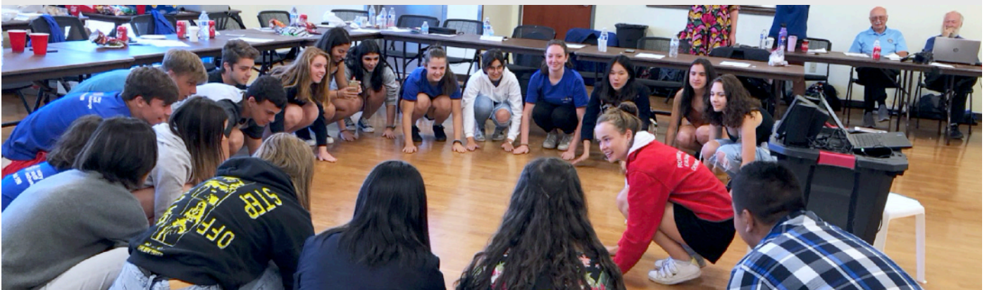
2019-2020 RYE Inbound students sharing ideas