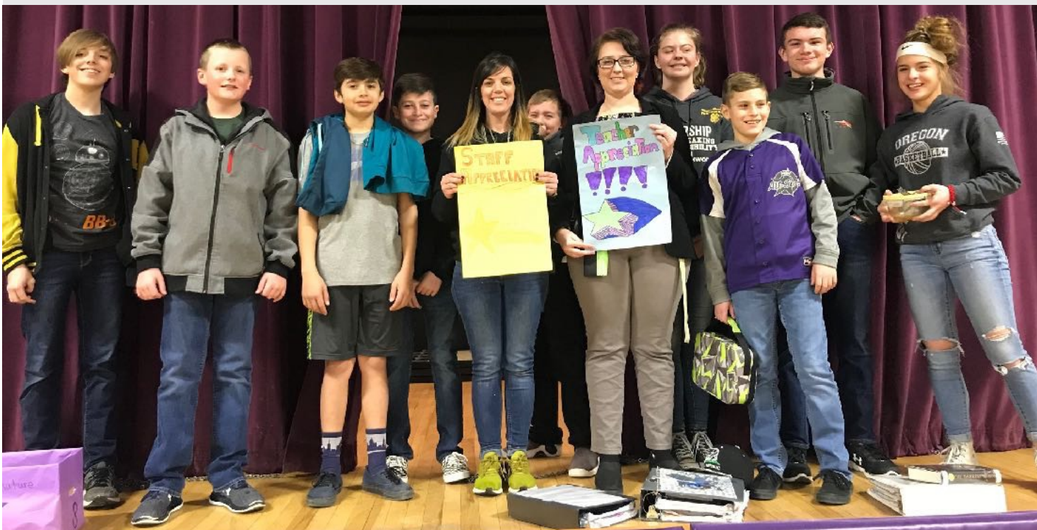
Modoc Middle School Interact Club honor Teachers and Staff during assemblies throughout the school year

Any Interact Club members may attend these trainings