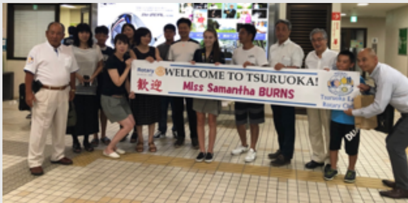
Outbound to Japan is met by a large Rotary group. Beginning of her year in Japan looks promising.