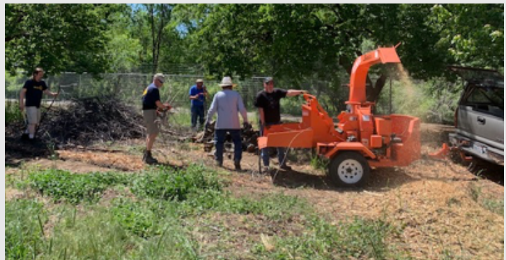
Susanville Sunrise - Community Garden 2018 - 2019

District Grants are a wonderful opportunity to put your Foundation dollars to work! Apply today!