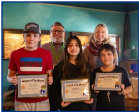
Lyman Gilmore’s January Student’s of the Month

SNMH was also named “Best Rural Hospital in the State.”