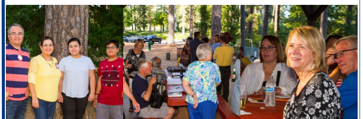
It was perfect weather to bring the family out to a Rotary event!