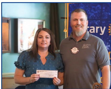
The Club provided a recent donation to Sierra Nevada Memorial Hospital Foundation's Read Me A Story