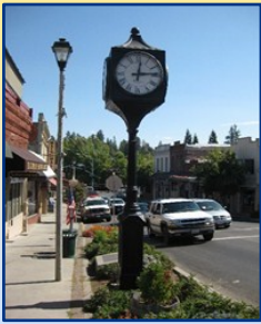
Club 529 chartered March 16, 1925