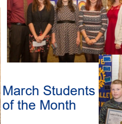
March Students of the Month