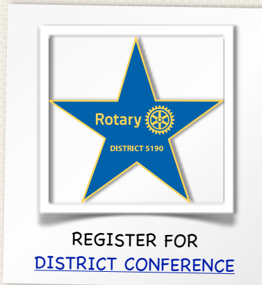
REGISTER FOR DISTRICT CONFERENCE