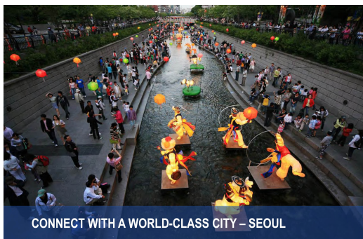
Rotary CONNECT WITH KOREA – TOUCH THE WORLD www.riconvention.org