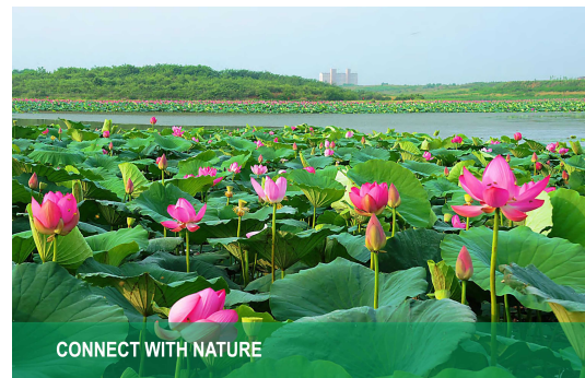
Rotary CONNECT WITH KOREA – TOUCH THE WORLD www.riconvention.org