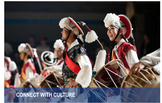
Rotary CONNECT WITH KOREA – TOUCH THE WORLD www.riconvention.org