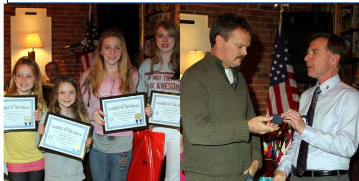
Lyman Gilmore Students of the Month for November 2013